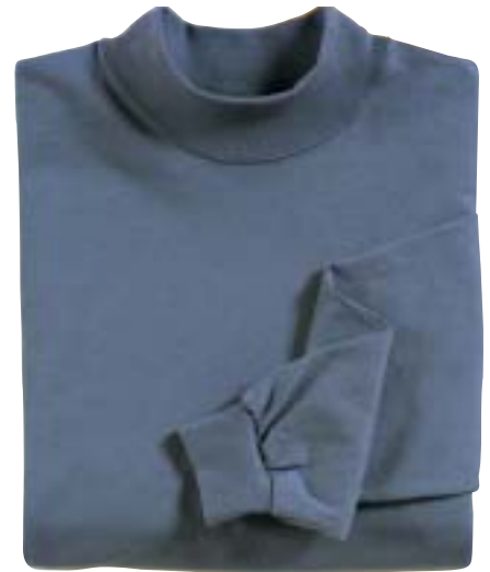
12479 "Cotton Deluxe" Mock Turtleneck 7.1 oz. 100% pre-shrunk extra heavyweight cotton, double-needle neck and bottom hem, and rib sleeve cuffs. Available S-XXL in the following colors: Neutrals: white 3x Heathers: ash, heather grey*. Colors: black 3x , ivy, lake, navy, river blue. *90/10 cotton/polyester