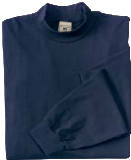
83010 Lee "Premium Jersey" Long Sleeve Mock 7.5 oz. 100% cotton, long sleeve with spandex reinforced rib collar & cuffs, taped neck & shoulders, double-needle hemmed bottom, quarter turned to eliminate center crease. Available M-XXL in the following colors: Neutrals: white. Lights: steel grey. Darks: black & navy.