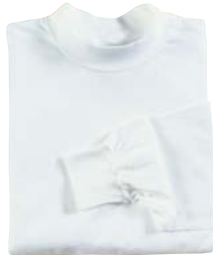
G2500 Mock Turtleneck 6.1 oz. 100% pre-shrunk cotton long sleeve mock turtleneck, double-needle top-stitched neckline, taped neck & shoulders, double-stitched sleeve & waist hem, quarter-turned body, Lycra® reinforced collar & cuffs. Available M-XXL in the following colors. Neutrals: white. Heathers: sports grey. Colors: black, forest, indigo, navy, red & sand.