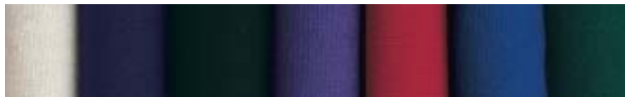
natural navy black purple red royal forest green