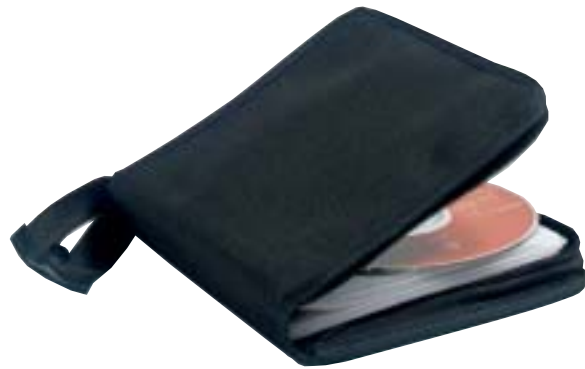
5501 Compact Disc Case (above) 600 denier polyester, foam filled, features 12 double sided vinyl sleeves with cotton sheeting dividers, 24 CD capacity. 5 7/8" x 5 7/8" x 3/4". Available in black.