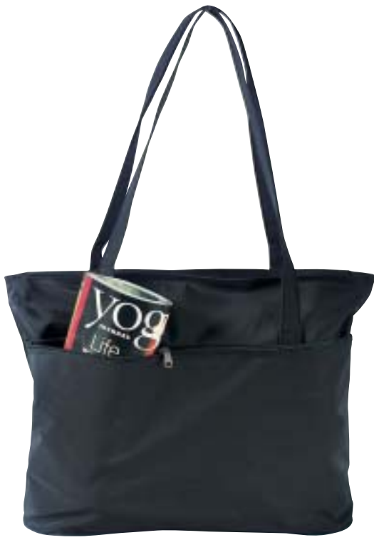
6010 Microfiber Tote Bag (above) front zipper pocket, interior zipper pocket. 16 1/4" x 13" x 4". 32" handles. Available in black.