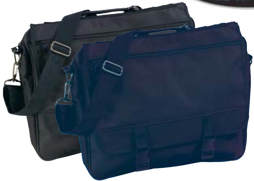
5213 Deluxe Brief Case 600 denier polyester, one main compartment, one slip pocket, two zippered pockets, accessory pockets & one exterior zippered pocket, key ring, i.d. tag, detachable/adjustable shoulder strap. 16" x 13.5" x 4". (zippered bottom gusset expands to 6.25"). Available in black & navy.