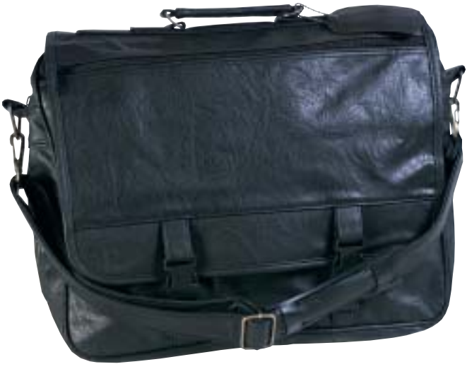
8213 Deluxe Simulated Leather Brief Bag One main compartment, one slip pocket, two zippered pockets, accessory pockets & key ring; one exterior zippered pocket, detachable/adjustable shoulder strap, i.d. tag. 16" x 13.5" x 4". (Zippered bottom gusset expands to 6.25"). Available in black only.