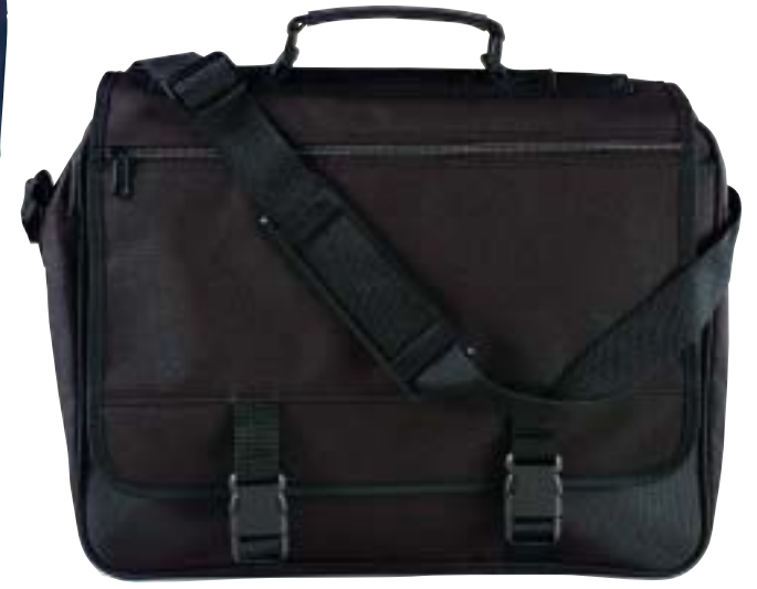
5211 Economy Brief Case 600 denier polyester, plastic hardware, adjustable shoulder strap, accessory pockets. 16" x 12" x 3 1/2". Available in black.