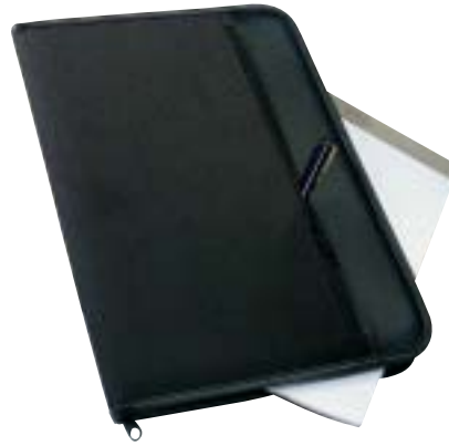
5783 Zippered Portfolio (above) 600 denier polyester, Yorkshire simulated leather trim, bound edges, front zippered pocket, writing pad included, cell phone pocket, PDA area with velcro, spare battery loops, business card slots, zippered compartment. 10.75" x 13.5" x 1.5". Available in black.