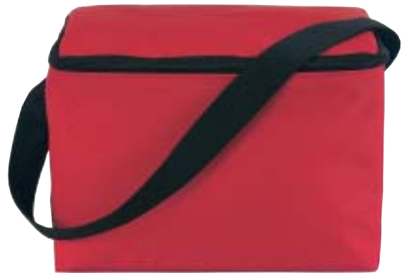
1694 Insulated Lunch Bag (below) Nylon with foam insulation, 210 denier nylon. 8.25" x 6.25" x 5". Available in black, navy, red & royal. All colors have black trim.